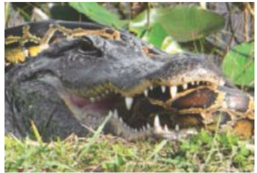
National Park Service