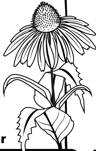
Purple Cone Flower

Flowers and their pollinators depend upon each other. Draw the type of pollinator that is described below for each plant.