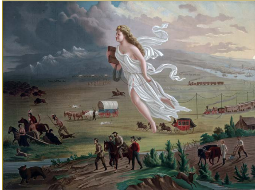
American Progress by John Gast, 1872