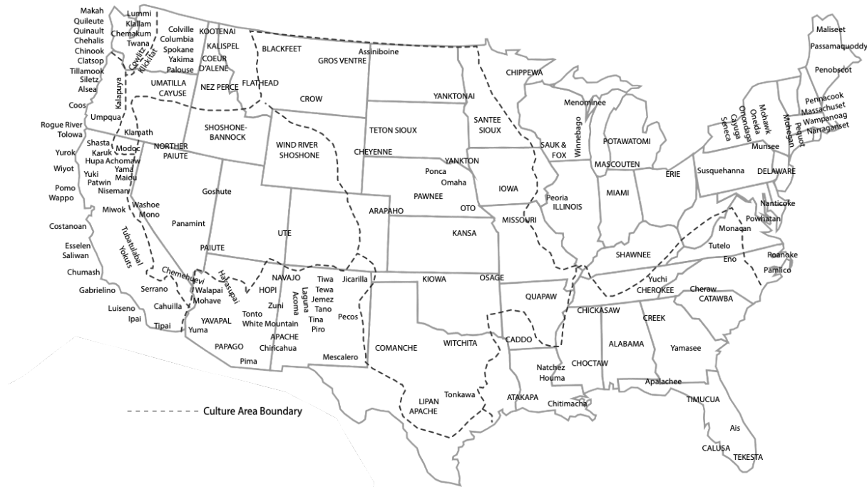
Document 2: Map of the United States in 1840.