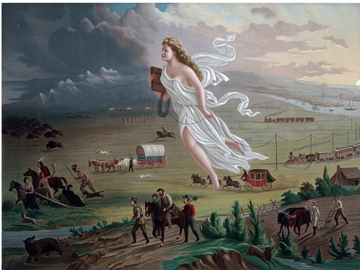
Gast, John. (1872). American Progress . Chromolithograph published by George A. Crofutt.

Begin by dividing students into groups of 3 or 4. Students will be working in these groups for most of the lesson. Use the attached Lesson Slides to guide the lesson. Start with slide three, showing the image below: