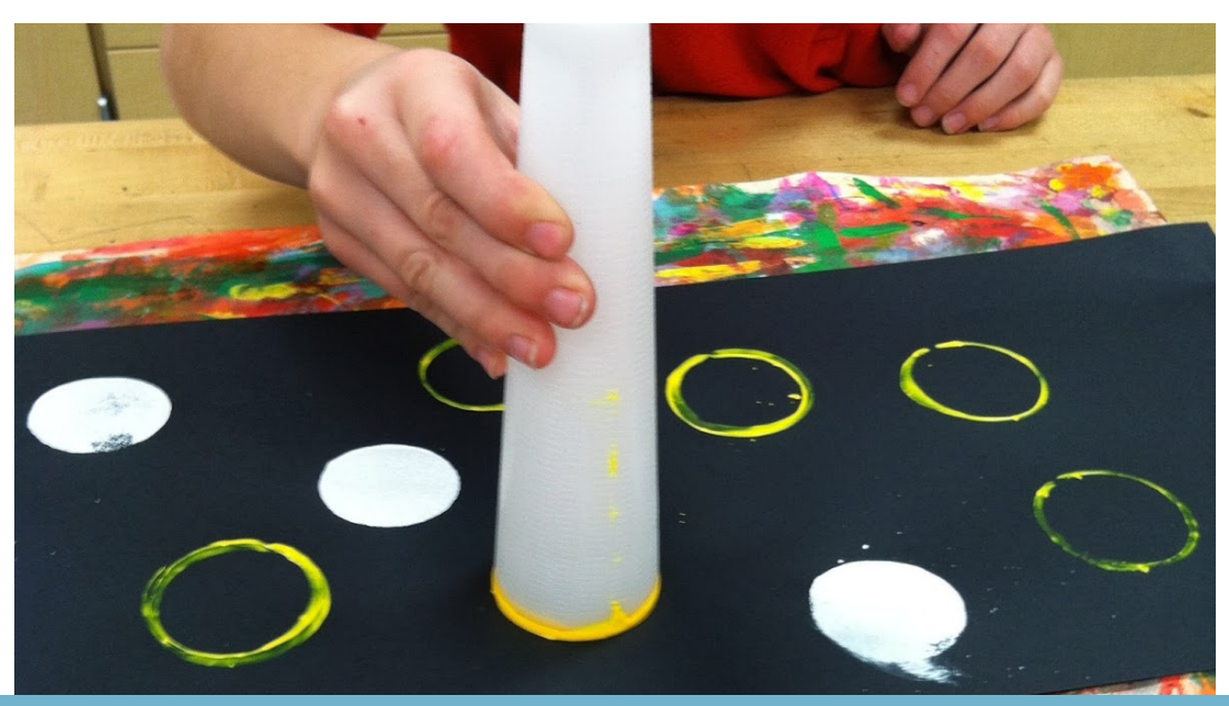
https://www.paintedpaperart.com/2014/02/retro-rockets/e bit of body text retrieved 05.09.22

During the first class period, student create a background with fluorescent paint and found objects or circular stamps dipped in the paint and added to the background to represent planets.